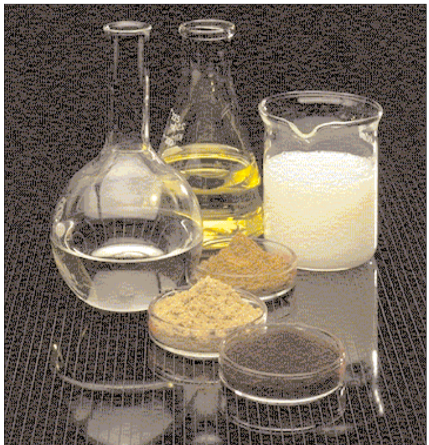
Rendered animal by-products. Petfood manufacturers want nutritional consistency, but do not want products manipulated to consistency.